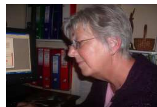
Love and Prayers in Him.